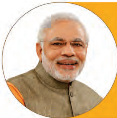
Shri Narendra Modi Prime Minister of India

“ Skilling is building a better India. If we have to move India towards development then Skill Development should be our mission. ”